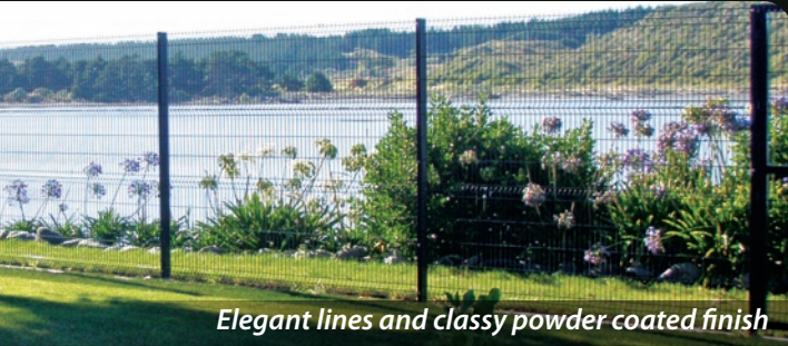
Elegant lines and classy powder coated finish