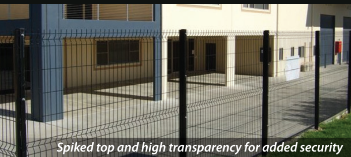
Spiked top and high transparency for added security