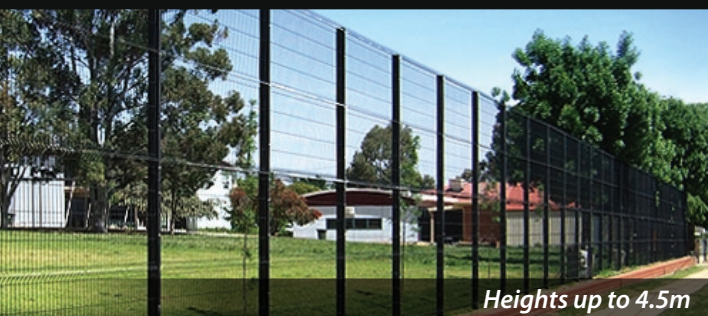
Heights up to 4.5m

Fast becoming the preferred security fencing solution due to its elegant appearance and ability to blend aesthetically with any landscape or environment.